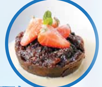
Traditional Christmas Pudding