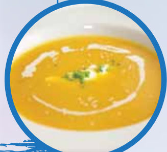
Roasted Parsnip and Pumpkin Soup