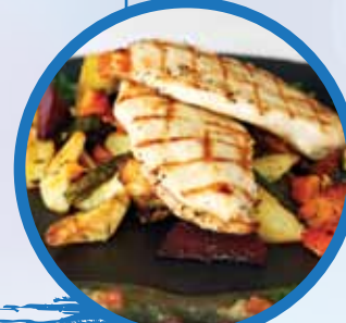
Organic Chicken (Label Rouge Bio)