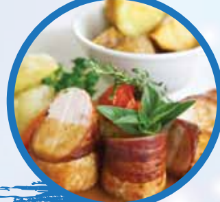
Slow Roasted Turkey